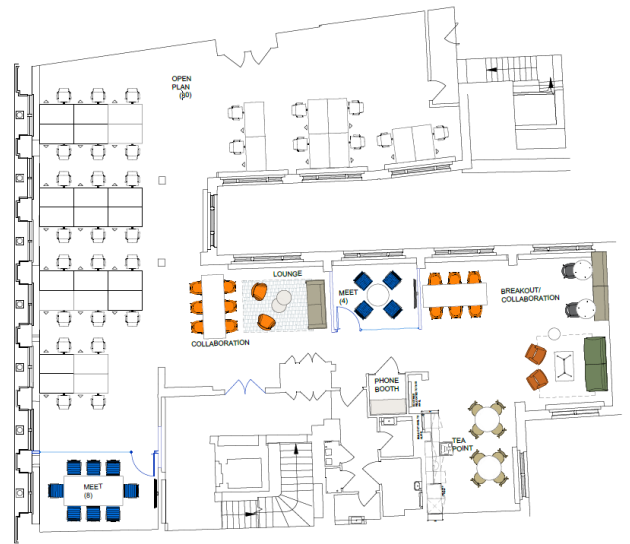
3 rd Floor Cat A +